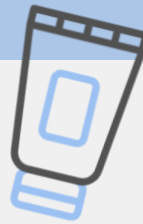
Purell GB7250 HD-PE

Medical material, biocompatibility ISO 10993