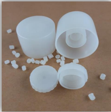
PSabic M1053 HD-PE

We now also offer our caps in PE. This allows you to market a mono tube with a RUBA cap. We have successfully sampled the materials listed below: